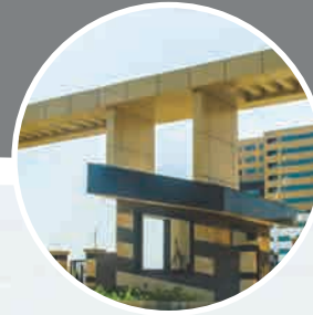
Stellar Business Park TZ-03, Greater Noida