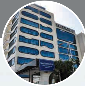
Stellar 135 Sec-135, Noida