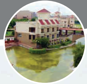
Stellar Gymkhana Club KP-II, Greater Noida